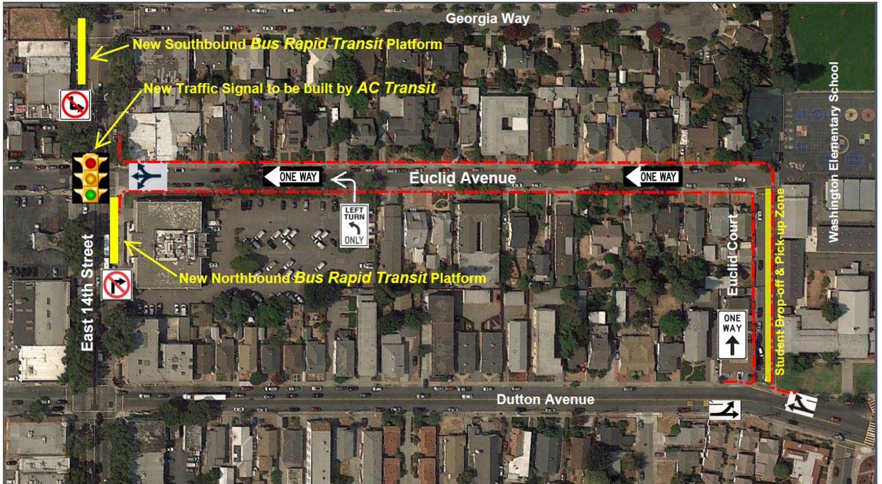
Euclid Avenue One-Way Traffic Reversal Proposal (March 2018)